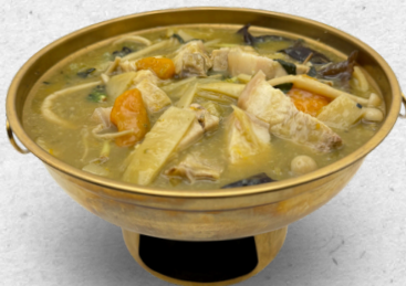
GANG NOR MAI