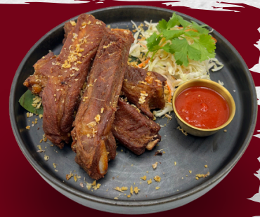
GARLIC PORK RIB