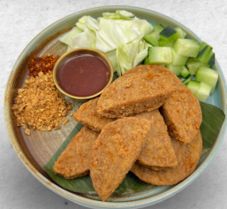
FRIED MOO YOR