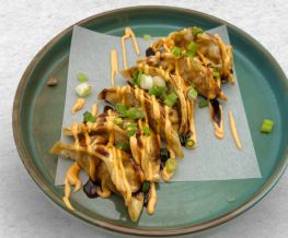
CHICKEN POT STICKER