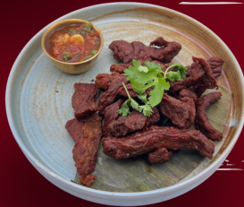
CHICKEN SOFT BONE