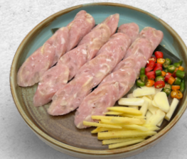
NAM SOM MOO