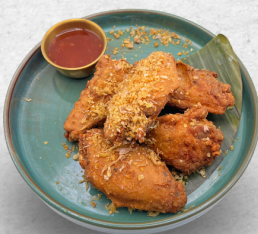
FRIED CHICKEN WINGS