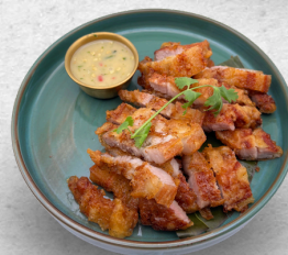
FRIED PORK BELLY