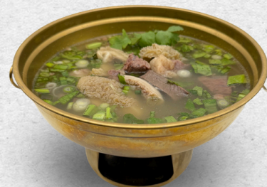
TOM KUENG NAI

Bamboo Soup, Pork Belly, Mushroom, Pumpkin and Basil Leaf